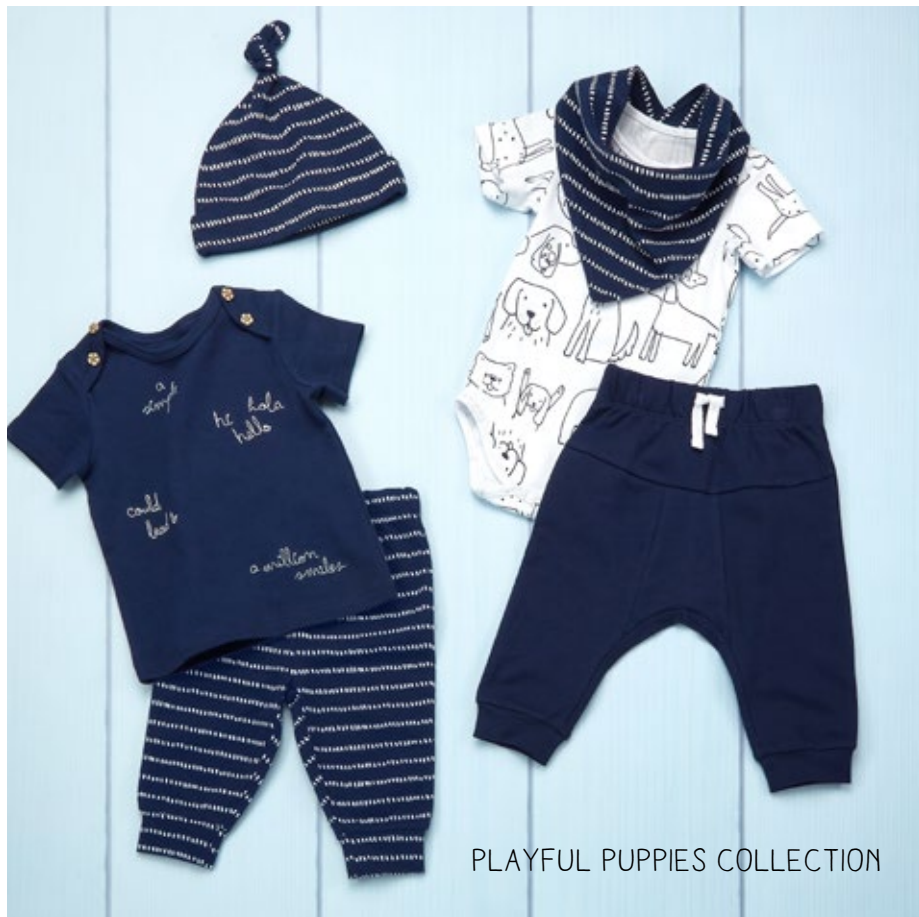
PLAYFUL PUPPIES COLLECTION