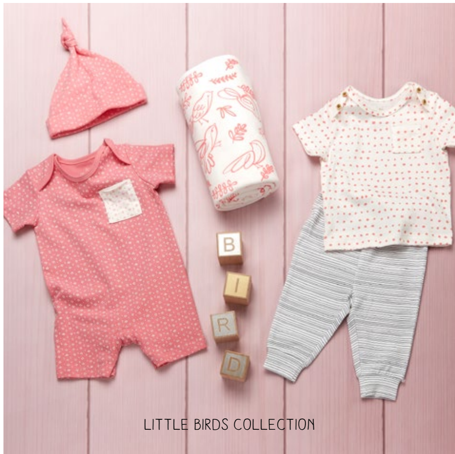
LITTLE BIRDS COLLECTION