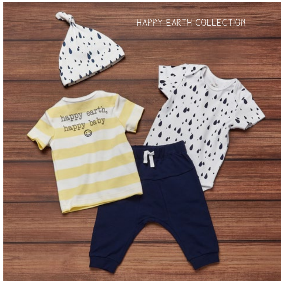
HAPPY EARTH COLLECTION