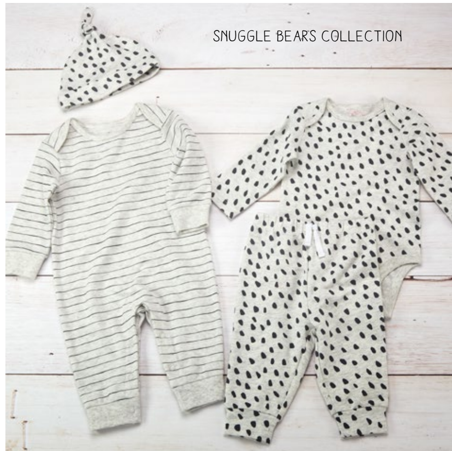
SNUGGLE BEARS COLLECTION